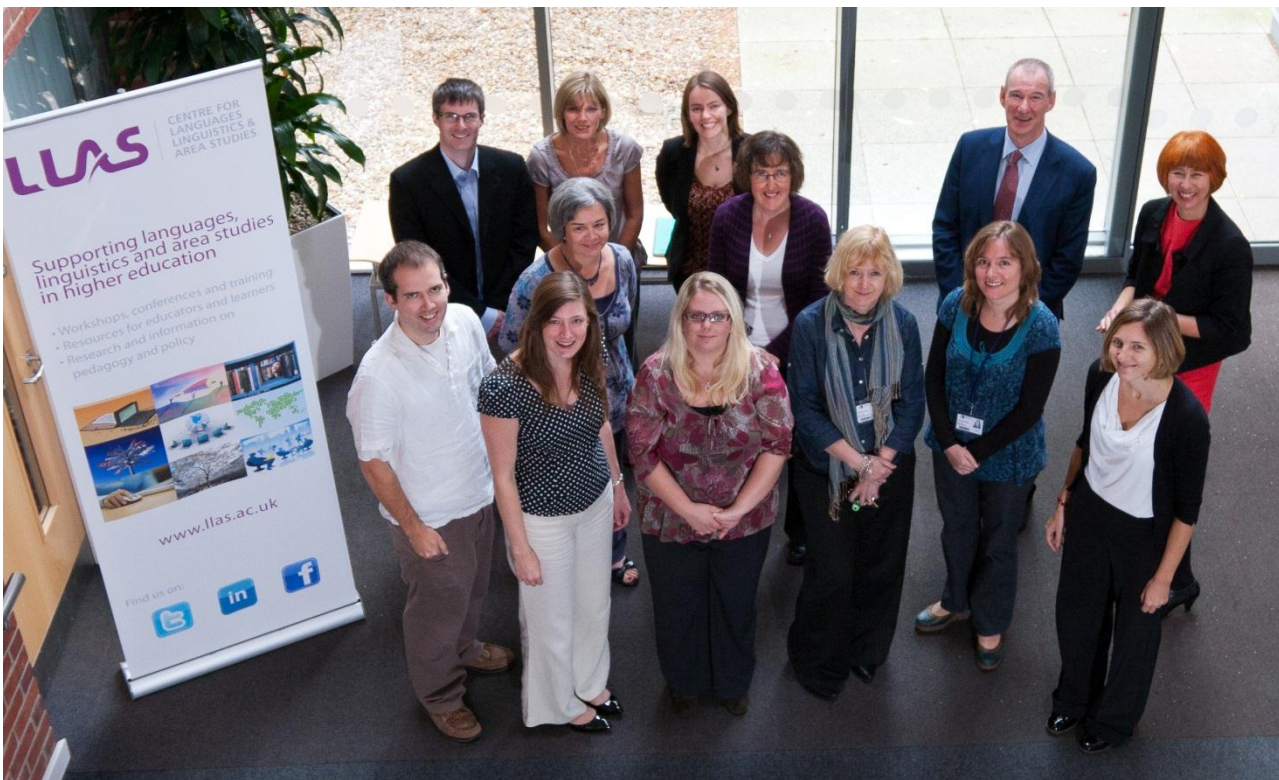
The team at LLAS Centre for languages, linguistics and area studies.